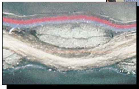
Pictured in multi-color tiers for clarity.